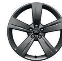
19" 5 Spoke, 'Style 5046' with Satin Dark Grey Finish