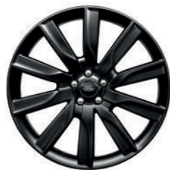
21" 10 Spoke, 'Style 1033' with Gloss Black Finish