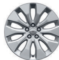
18" 10 Spoke, 'Style 1021'

Personalise your vehicle with a selection of alloy wheels featuring a wide range of contemporary and dynamic designs.