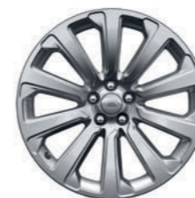
20" 10 Spoke, 'Style 1032'