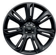
20" 7 Spoke, 'Style 7014' with Gloss Black Finish