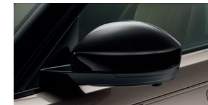
Mirror Covers – Gloss Black Gloss Black mirror covers to enhance the vehicle's exterior design cues.