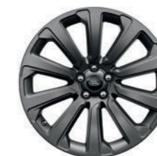
20" 10 Spoke, 'Style 1032' with Satin Dark Grey Finish