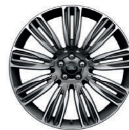
22" 9 Split-Spoke, 'Style 9007' with Diamond Turned Finish