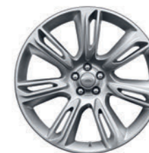
20" 7 Spoke, 'Style 7014'