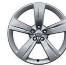
19" 5 Spoke, 'Style 5046'