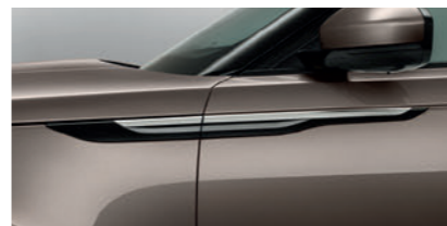
Side Vents – Bright Finish Bright side vents provide a subtle exterior design enhancement.