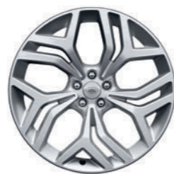
21" 5 Split-Spoke, 'Style 5047'