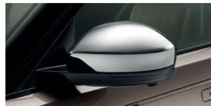
Mirror Covers – Chrome Chrome mirror covers to enhance the vehicle's exterior design cues.