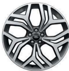
21" 5 Split-Spoke, 'Style 5047' with Diamond Turned Finish