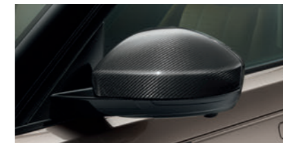
Mirror Covers – Carbon Fibre Stunning high grade Carbon Fibre mirror covers, with a High Gloss finish, provide a performance-inspired premium styling update.