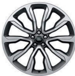
22" 10 Spoke, 'Style 1051' Diamond Turned with Satin Technical Grey Finish