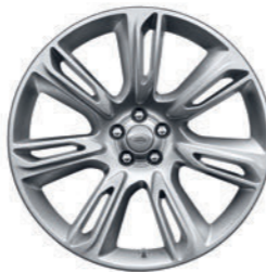
22" 7 Split-Spoke, 'Style 7015'