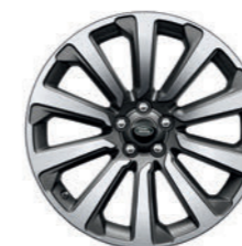
20" 10 Spoke, 'Style 1032' with Diamond Turned Finish