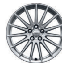
18" 15 Spoke, 'Style 1022'