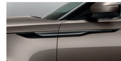
Side Vents – Carbon Fibre High-grade Carbon Fibre side power vents with a High Gloss finish provide a performance-inspired styling upgrade.