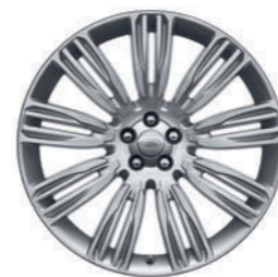
22" 9 Split-Spoke, 'Style 9007'