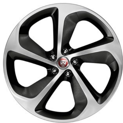
20" Style 5062, Forged, 5 spoke