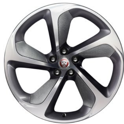
20" Style 5062, Forged, 5 spoke, Carbon Fibre Silver Weave