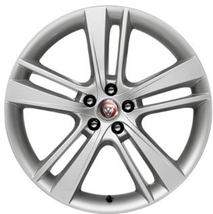
20" Style 5041, 5 split-spoke