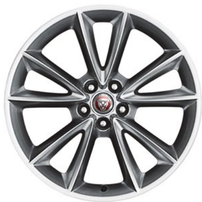
19" Style 5057, 5 split-spoke