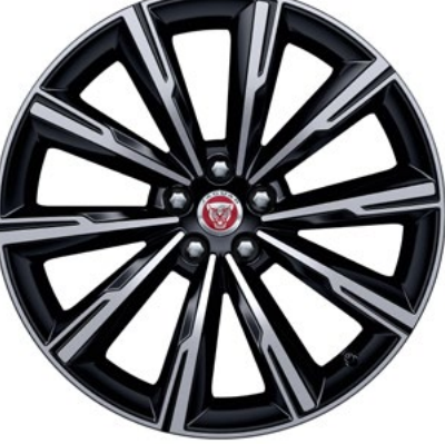
20" Style 1066, 10 spoke, Gloss Black Diamond Turned finish