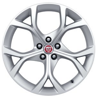
19" Style 5101, 5 split-spoke, Silver