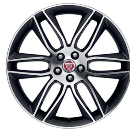
20" Style 6003, 6 split-spoke, Dark Grey Diamond Turned finish