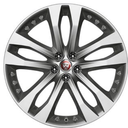
20" Style 5039, 5 split-spoke