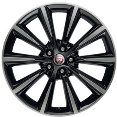
19" Style 1026, 10 spoke, Gloss Black Diamond Turned finish