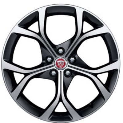
19" Style 5101, 5 split-spoke, Gloss Black Diamond Turned finish