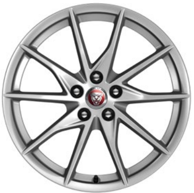
18" Style 1036, 10 spoke