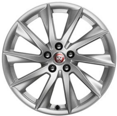
18" Style 1024, 10 spoke