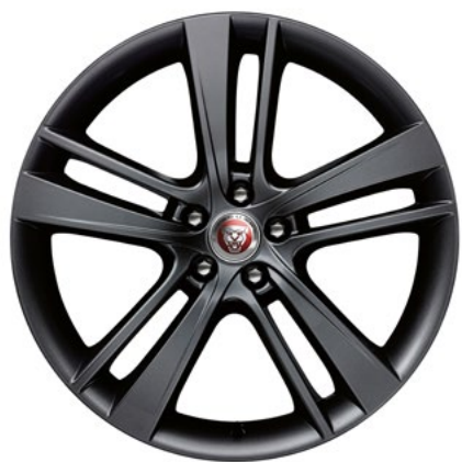
20" Style 5041, 5 split-spoke, Gloss Black