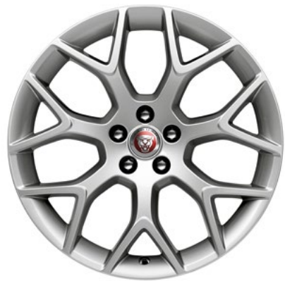
19" Style 7013, 7 split-spoke