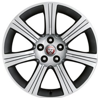
18" Style 7017, 7 spoke