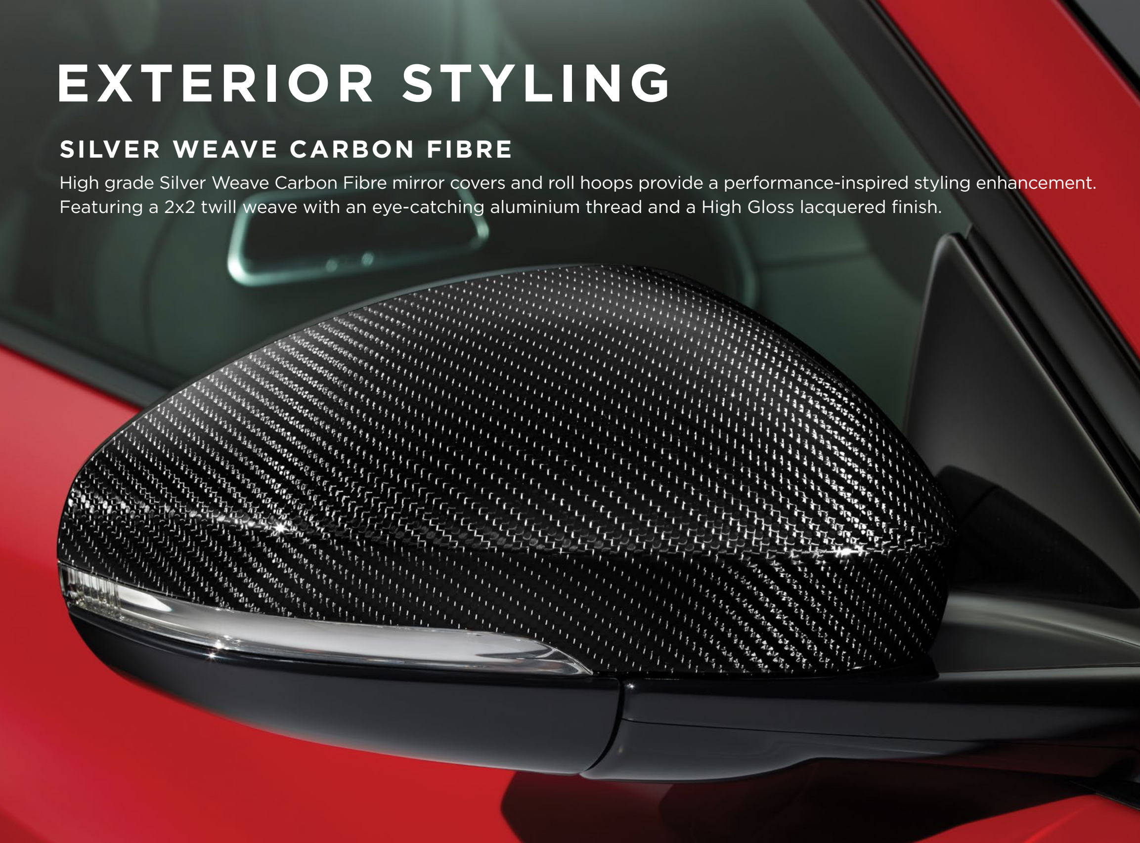
Silver Weave Carbon Fibre Mirror Covers

High grade Silver Weave Carbon Fibre mirror covers and roll hoops provide a performance-inspired styling enhancement. Featuring a 2x2 twill weave with an eye-catching aluminium thread and a High Gloss lacquered finish.