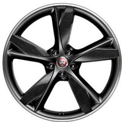
20" Style 5042, 5 spoke, Forged, Carbon Fibre and Satin Dark Grey Diamond Turned finish