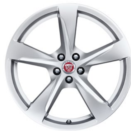
20" Style 5060, 5 spoke