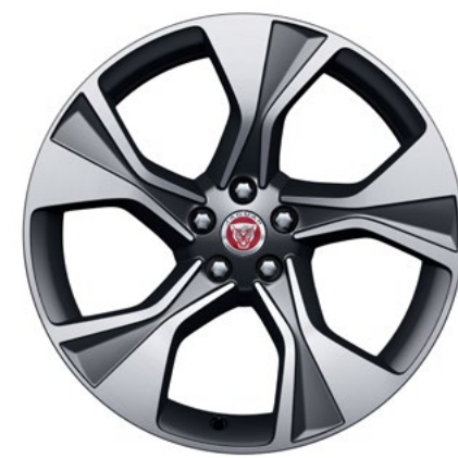
20" Style 5102, 5 spoke, Technical Grey Diamond Turned finish