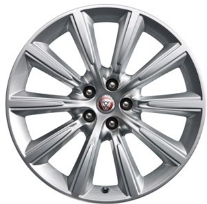
19" Style 1026, 10 spoke