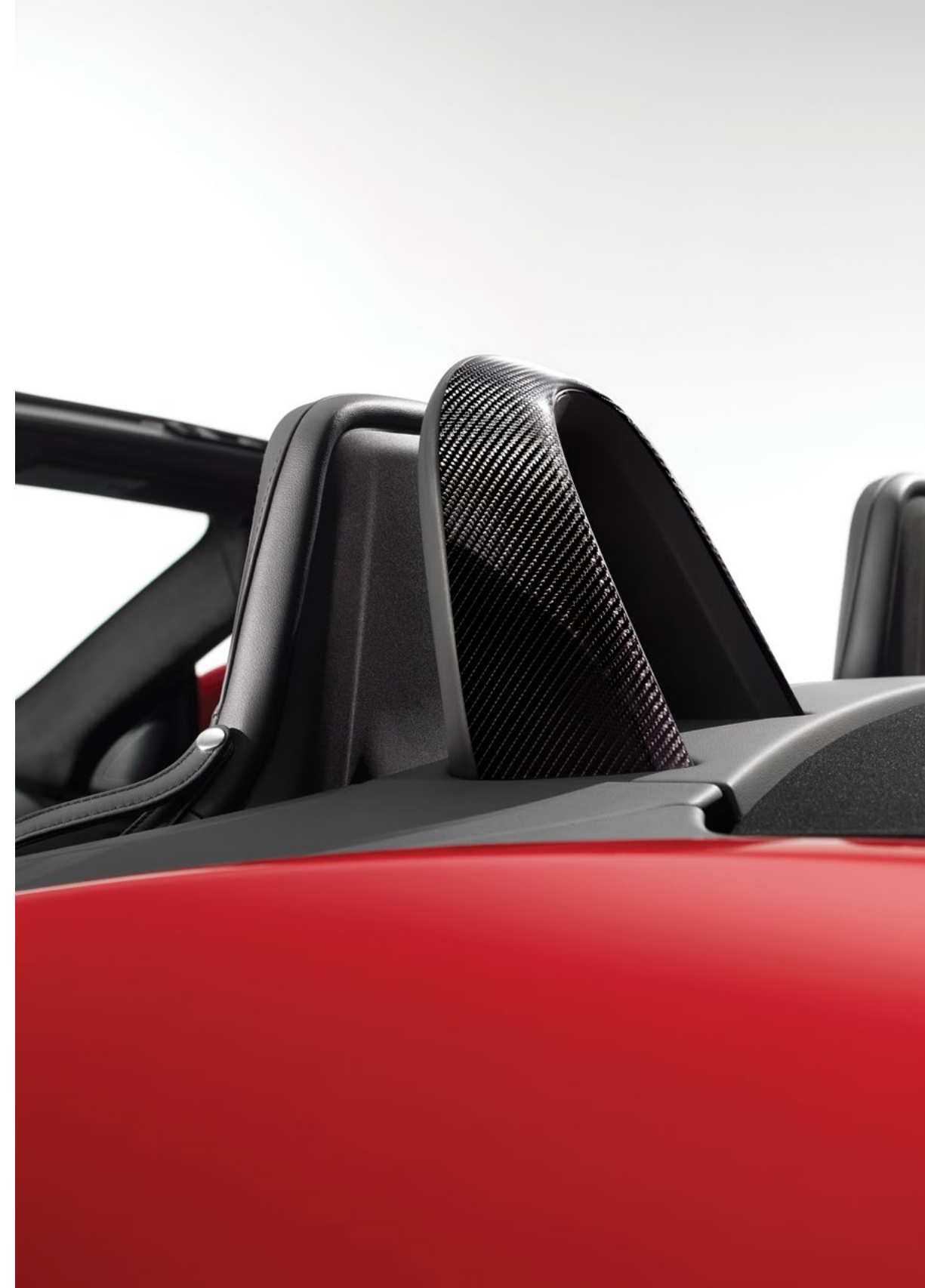
Silver Weave Carbon Fibre Roll Hoops