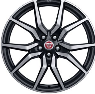
20" Style 1041, 10 spoke, Forged, Satin Black Diamond Turned finish