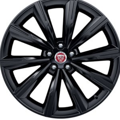
20" Style 1066, 10 spoke, Gloss Black