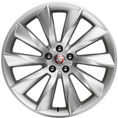
20" Style 1025, 10 spoke