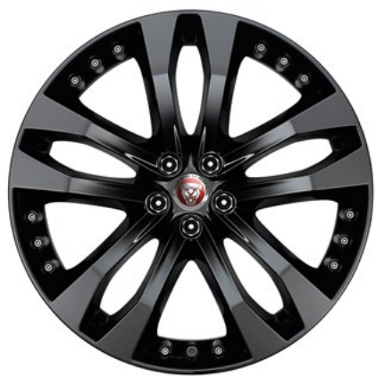
20" Style 5039, 5 split-spoke, Gloss Black