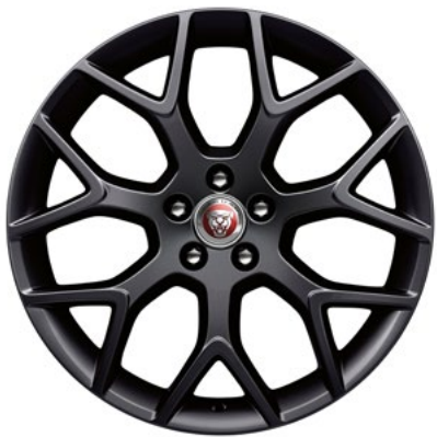
19" Style 7013, 7 split-spoke, Black