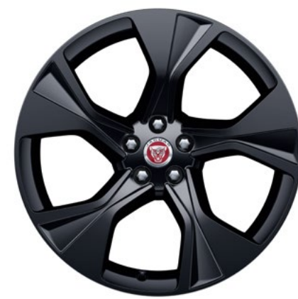
20" Style 5102, 5 spoke, Gloss Black