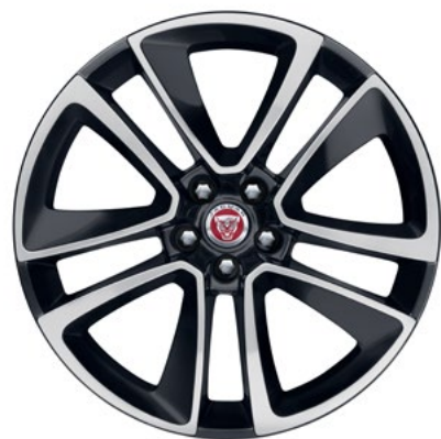
19" Style 5058, 5 split-spoke, Technical Grey Diamond Turned finish