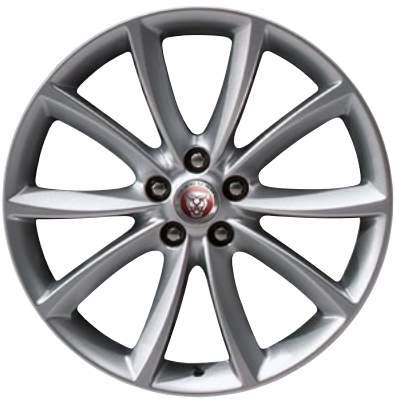
19" Style 1023, 10 spoke