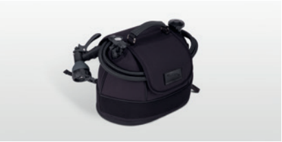
Portable Rinse System Designed to be used outside the vehicle, the portable rinse system provides a convenient solution for washing pets before loading or rinsing down other equipment from bikes to wetsuits.