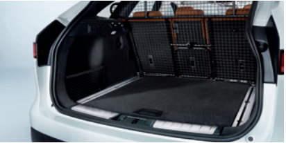
Luggage Compartment Partition - Full Height The luggage compartment partition is designed to safely secure dogs or other pets in the luggage compartment area and to prevent luggage from entering the passenger compartment.