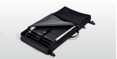
Pet Access Ramp Designed with optimal dimensions and angle, the pet access ramp assists pets into the luggage compartment without the owner having to lift them, making it ideal for owners who regularly carry dogs or other pets in the luggage compartment of their vehicle.