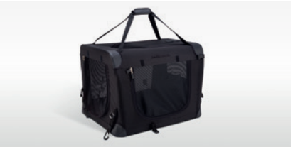
Foldable Pet Carrier The foldable pet carrier provides a safe, comfortable environment for the transportation of pets, making it ideal for owners who regularly carry dogs or other pets in the luggage compartment of their vehicle.