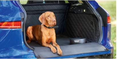
Quilted Luggage Compartment Liner This tailored liner covers and protects all the carpeted areas of the luggage compartment including the floor, second row seat backs and luggage compartment side walls.