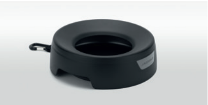
Spill Resistant Water Bowl Providing a convenient solution for use in transit or outside of the vehicle, the spill resistant water bowl incorporates a clever design feature which redirects water towards the centre of the bowl when the water is disturbed.