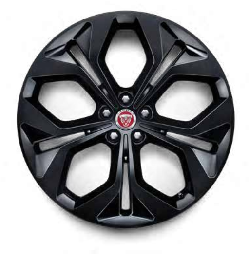
21" Style 5053, 5 split-spoke, Gloss Black