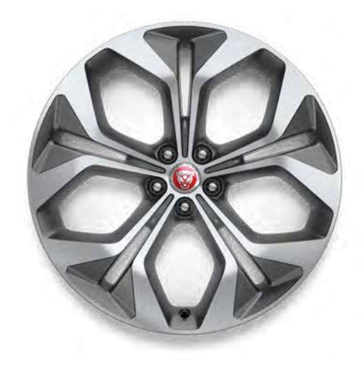
21" Style 5053, 5 split-spoke, Satin Grey Diamond Turned finish