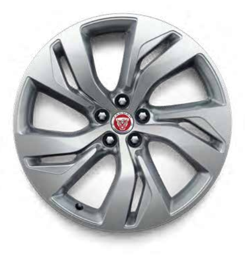
20" Style 5120, 5 spoke, Chrome Shadow