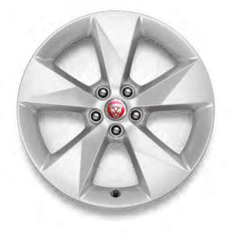
18" Style 5048, 5 spoke, Gloss Sparkle Silver