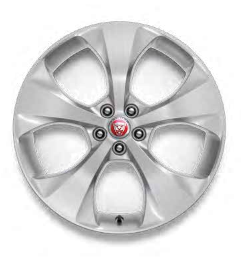
20" Style 5054, 5 spoke, Gloss Sparkle Silver

Personalise your vehicle with a selection of alloy wheels featuring a wide range of contemporary and dynamic designs.