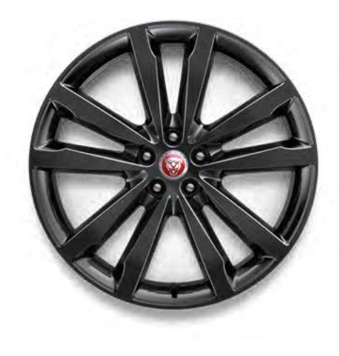
20" Style 5051, 5 split-spoke, Gloss Black