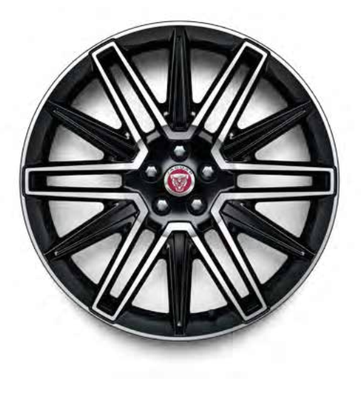
21" Style 1078, 12 split-spoke, Gloss Black Diamond Turned finish