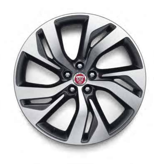
20" Style 5120, 5 spoke, Satin Grey Diamond Turned finish