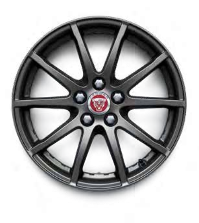
17″ Style 1005, 10 spoke, Satin Dark Grey

Personalise your vehicle with a selection of alloy wheels featuring a wide range of contemporary and dynamic designs.