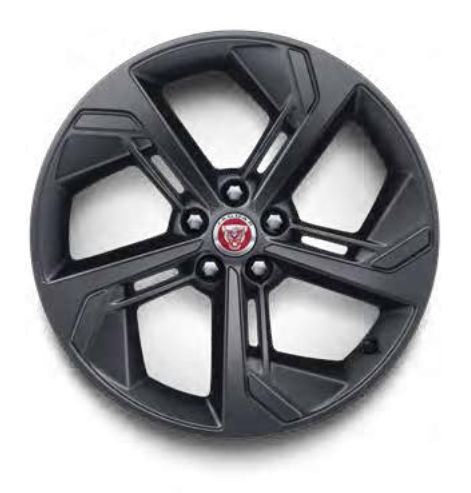
19" Style 5119, 5 spoke, Satin Dark Grey