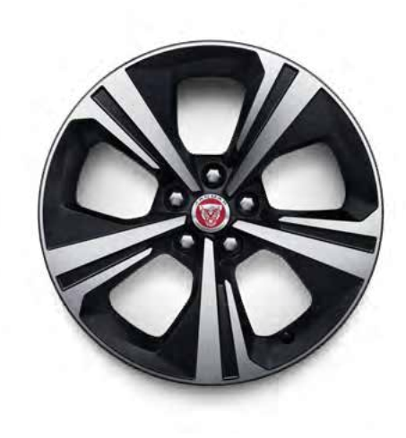
18″ Style 5118, 5 spoke, Satin Black Diamond Turned finish