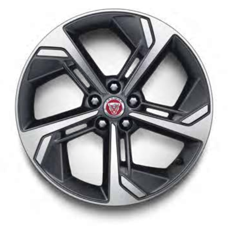
19" Style 5119, 5 spoke, Satin Dark Grey Diamond Turned finish