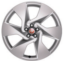
20" 6 Spoke 'Style 6007', Alloy Wheel