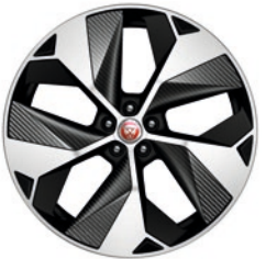
22" 5 Spoke 'Style 5069' with Technical Grey finish and Carbon Fibre inserts, Alloy Wheel