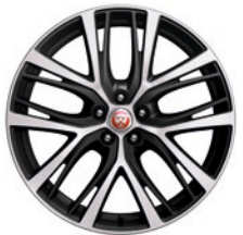
20" 5 Split-Spoke 'Style 5070' with Diamond Turned Technical Grey finish, Alloy Wheel