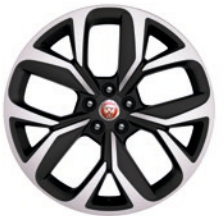
20" 5 Spoke 'Style 5068' with Diamond Turned finish, Alloy Wheel