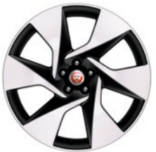
20" 6 Spoke 'Style 6007' with Diamond Turned finish, Alloy Wheel