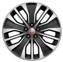
18" 5 Split-Spoke 'Style 5055', Alloy Wheel

Personalise your vehicle with a selection of alloy wheels featuring a wide range of contemporary and dynamic designs.