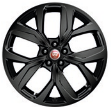
20" 5 Spoke 'Style 5068' with Gloss Black finish, Alloy Wheel