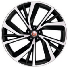
22" 5 Split-Spoke 'Style 5056' with Diamond Turned finish, Alloy Wheel