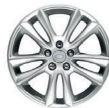
19" 5 Split-Spoke, 'Style 5001'

Personalise your vehicle with a selection of alloy wheels featuring a wide range of contemporary and dynamic designs.