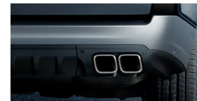
Rear Bumper with Integrated Bright Exhaust Finishers