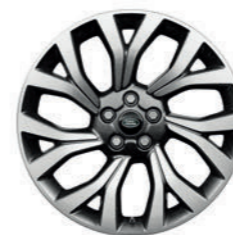
21" 7 Split-Spoke, 'Style 7001' with Light Silver Diamond Turned Finish