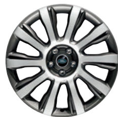
21" 10 Split-Spoke, 'Style 1001' with Diamond Turned Finish