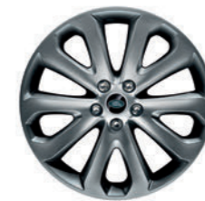
20" 5 Split-Spoke, 'Style 5002' with Shadow Chrome Finish