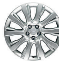
21" 10 Spoke, 'Style 1001' with Silver Sparkle Finish