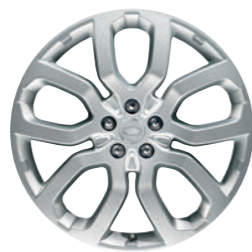
22" 5 Split-Spoke, 'Style 5004'