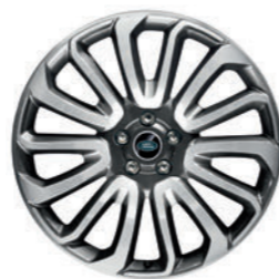
22" 7 Split-Spoke, 'Style 7007' with Diamond Turned Finish