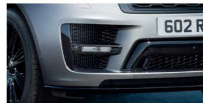
Front Bumper with Enlarged Intakes

SVO design packs provide purposeful, dynamic and stunning styling enhancements that allow you to add your own stamp of individuality by tailoring your Range Rover. Exterior features include a unique front bumper, rear bumper with integrated tailpipes, side vents, grille and side sill claddings.