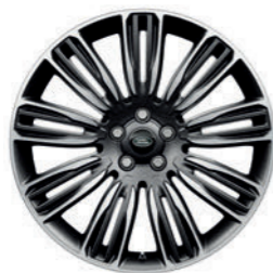
22" 9 Split-Spoke, 'Style 9012' with Mid-Silver Diamond Turned Finish