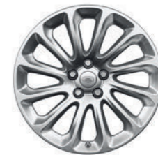
20" 12 Spoke, 'Style 1065'