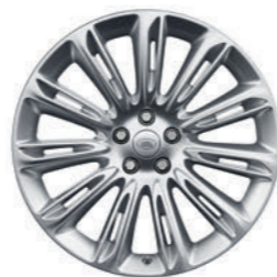
22" 11 Spoke, 'Style 1046'