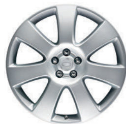
22" 7 Split-Spoke, 'Style 7008'