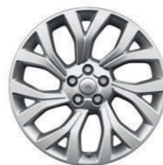
21" 7 Split-Spoke, 'Style 7001' with Silver Finish