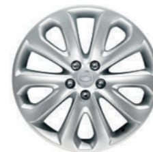
20" 5 Split-Spoke, 'Style 5002'