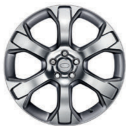
22" 6 Spoke, 'Style 6001' with Diamond Turned Finish