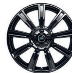
21" 9 Spoke, 'Style 9001' with Gloss Black Finish