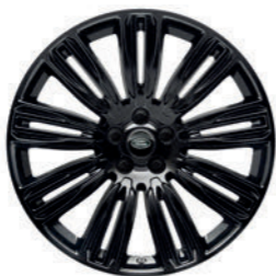
22" 9 Split-Spoke, 'Style 9012' with Gloss Black Finish