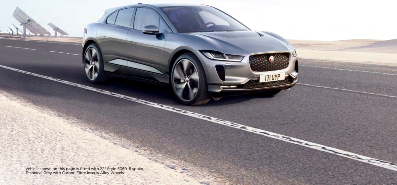
Vehicle shown on this page is fitted with 22" Style 5069, 5 spoke, Technical Grey with Carbon Fibre inserts Alloy Wheels