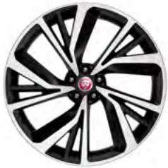
22" Style 5056, 5 split-spoke, Dark Grey Diamond Turned finish