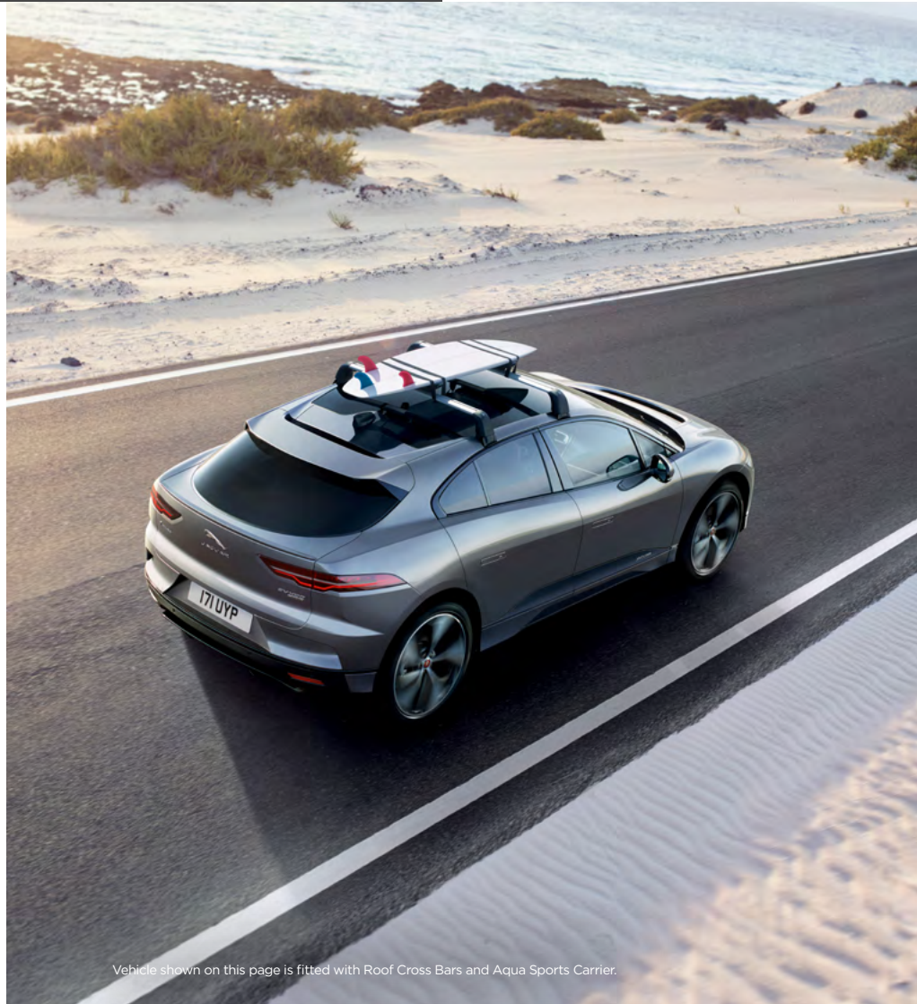
Vehicle shown on this page is fitted with Roof Cross Bars and Aqua Sports Carrier.