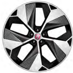
22" Style 5069, 5 spoke, Technical Grey with Carbon Fibre inserts