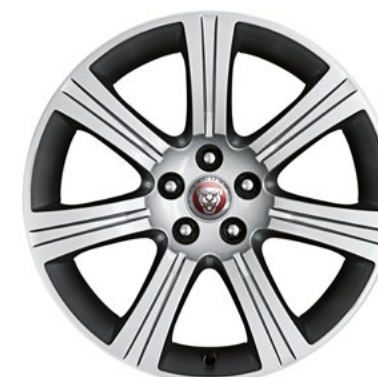
18" Style 7017, 7 spoke