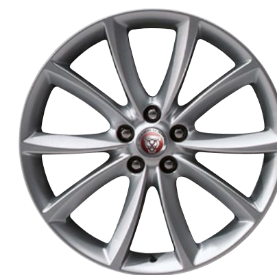
19" Style 1023, 10 spoke