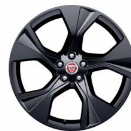
20" Style 5102, 5 spoke, Gloss Black T2R43123 RM7,104.17 T2R43124 RM7,532.63