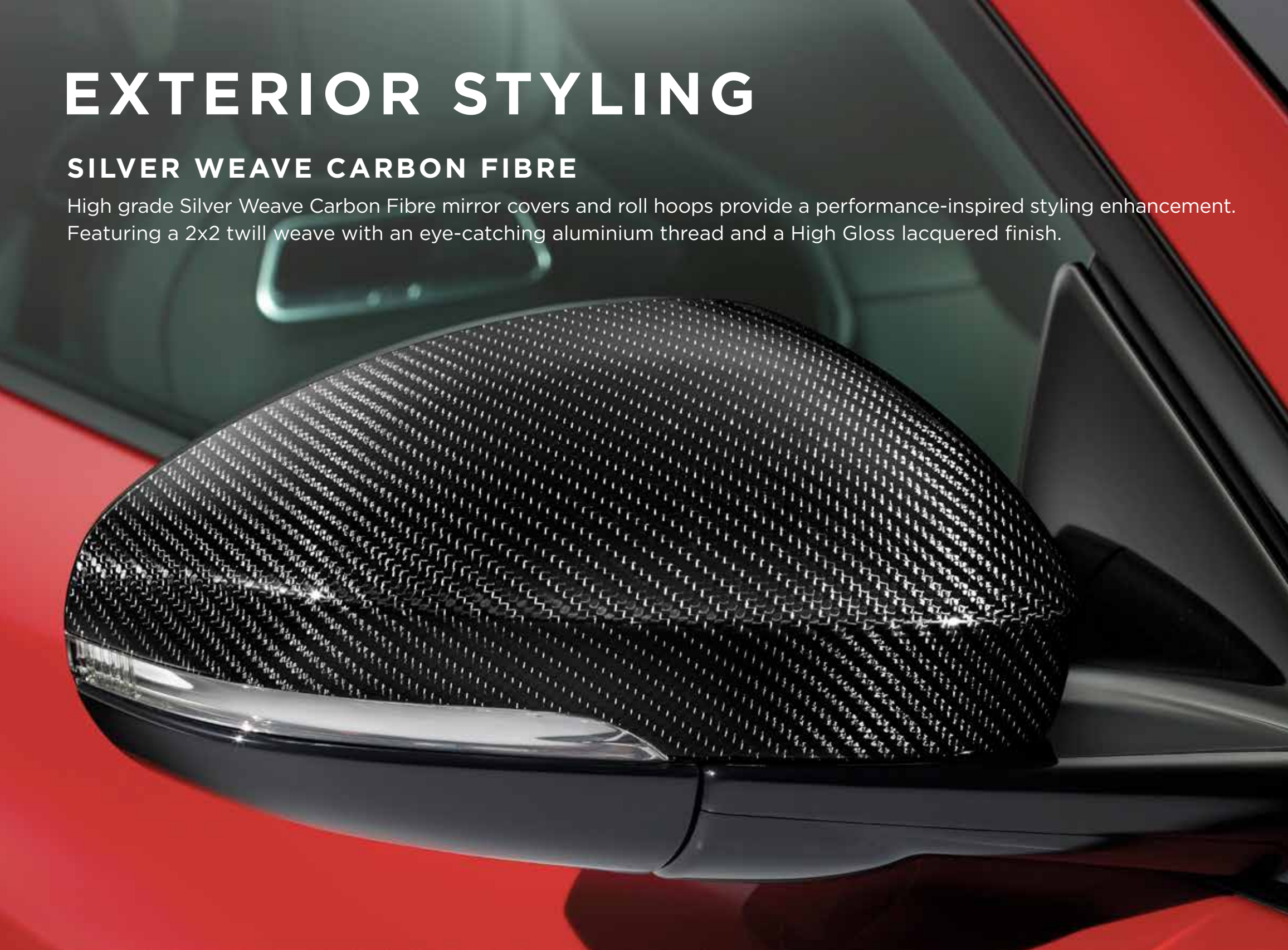
Silver Weave Carbon Fibre Mirror Covers

High grade Silver Weave Carbon Fibre mirror covers and roll hoops provide a performance-inspired styling enhancement. Featuring a 2x2 twill weave with an eye-catching aluminium thread and a High Gloss lacquered finish.