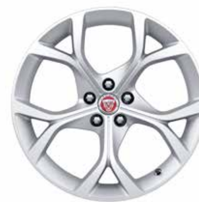
19" Style 5101, 5 split-spoke, Silver T2R45849 RM5,329.54 T2R45850 RM5,696.69