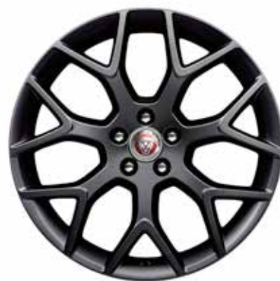
19" Style 7013, 7 split-spoke, Black T2R4750 RM5,902.79 T2R4752 RM5,902.79