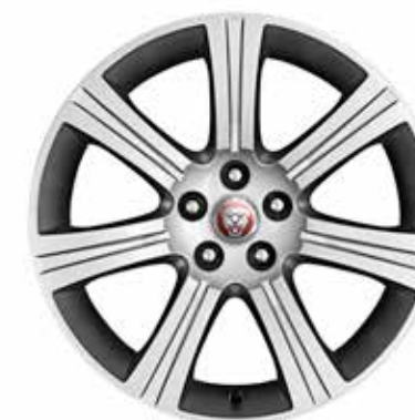
18" Style 7017, 7 spoke