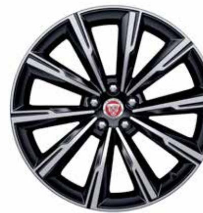
20" Style 1066, 10 spoke, Gloss Black Diamond Turned finish N/A