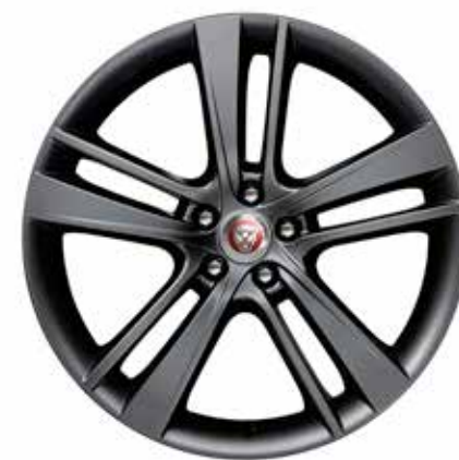
20" Style 5041, 5 split-spoke, Gloss Black T2R4746 RM7,300.08 T2R4748 RM7,300.08