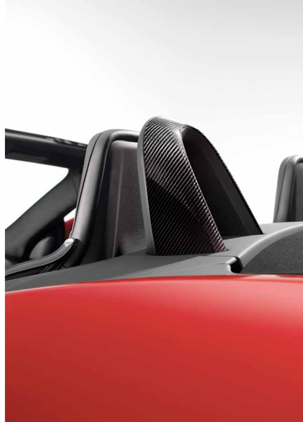
Silver Weave Carbon Fibre Roll Hoops