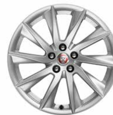
18" Style 1024, 10 spoke