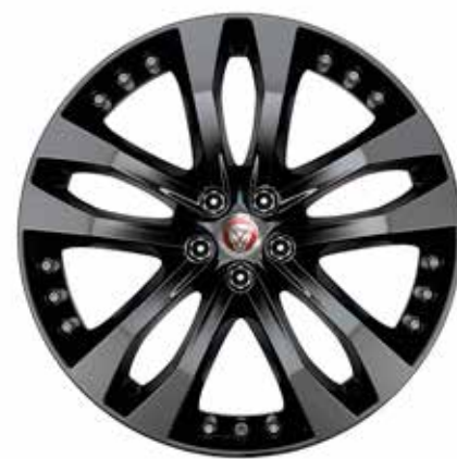
20" Style 5039, 5 split-spoke, Gloss Black T2R3288 RM6,850.95 T2R3289 RM6,970.97