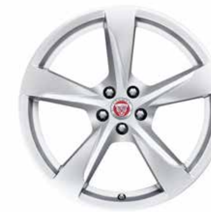
20" Style 5060, 5 spoke T2R17515 RM6,859.46 T2R17516 RM7,300.08