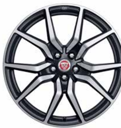
20" Style 1041, 10 spoke, Forged, Satin Black Diamond Turned finish N/A