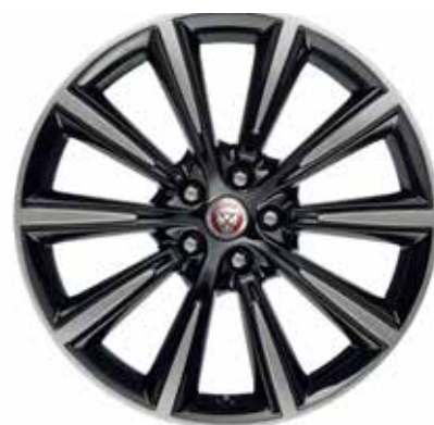
19" Style 1026, 10 spoke, Gloss Black Diamond Turned finish T2R9706 RM5,880.27 T2R9707 RM6,320.89