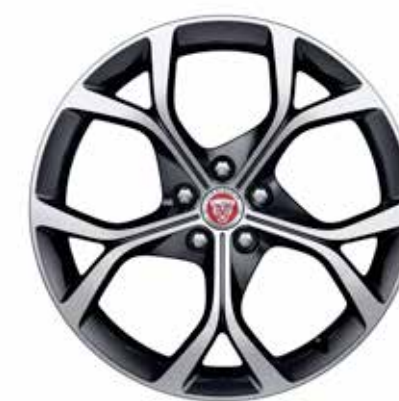
19" Style 5101, 5 split-spoke, Gloss Black Diamond Turned finish T2R45851 RM5,880.27 T2R45852 RM6,308.73