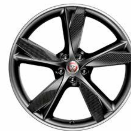
20" Style 5042, 5 spoke, Forged, Carbon Fibre and Satin Dark Grey Diamond Turned finish T2R20830 RM13,687.35 T2R20831 RM13,687.35