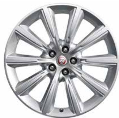
19" Style 1026, 10 spoke T2R9704 RM5,231.58 T2R9705 RM5,672.20