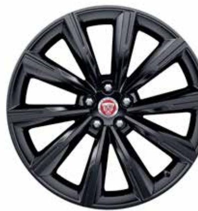
20" Style 1066, 10 spoke, Gloss Black N/A