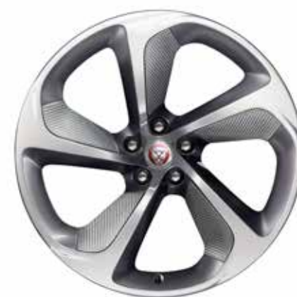
20" Style 5062, Forged, 5 spoke, Carbon Fibre Silver Weave T2R11271 RM13,687.35 T2R11272 RM13,687.35