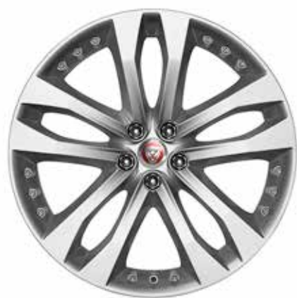
20" Style 5039, 5 split-spoke T2R3286 RM6,357.89 T2R3287 RM6,724.36