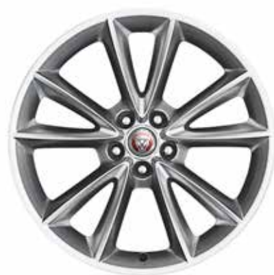
19" Style 5057, 5 split-spoke C2P12619 RM5,231.58 C2P12620 RM5,672.20