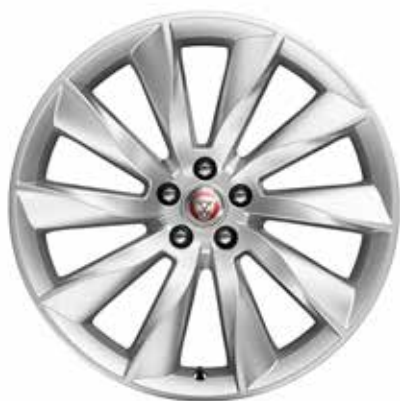
20" Style 1025, 10 spoke T2R1864 RM6,859.46 T2R1866 RM7,300.08