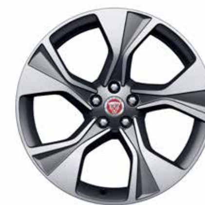
20" Style 5102, 5 spoke, Technical Grey Diamond Turned finish T2R43121 RM7,471.50 T2R43122 RM7,899.79