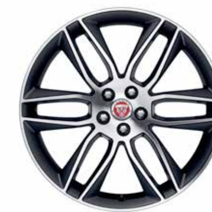
20" Style 6003, 6 split-spoke, Dark Grey Diamond Turned finish T2R12014 RM7,300.08 T2R12015 RM7,300.08