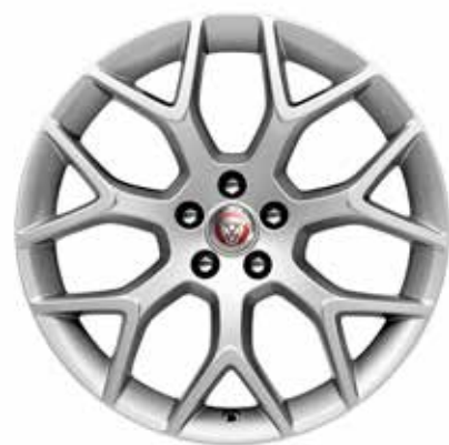
19" Style 7013, 7 split-spoke T2R4749 RM5,672.20 T2R4751 RM5,672.20