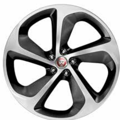
20" Style 5062, Forged, 5 spoke T2R3292 RM9,907.15 T2R3293 RM9,890.88