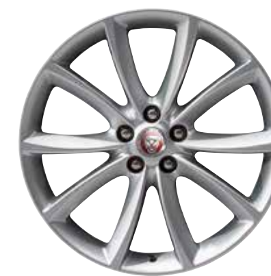
19" Style 1023, 10 spoke