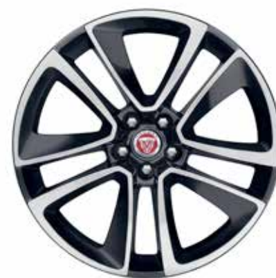
19" Style 5058, 5 split-spoke, Technical Grey Diamond Turned finish T2R14421 RM5,476.29 T2R14422 RM5,917.09