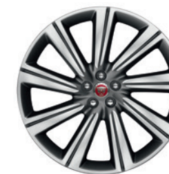
22" Turbine, 9 spoke, with Grey Diamond Turned finish