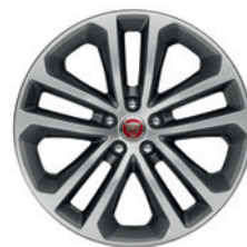
19" Bionic, 5 twin-spoke, with Grey Diamond Turned finish