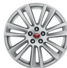
19" Razor, 7 twin-spoke, with Silver finish