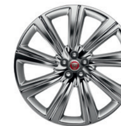
22" Turbine, 9 spoke, with Polished finish