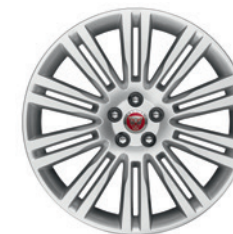
20" Matrix, 10 twin-spoke, with Silver finish