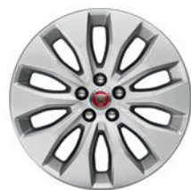
18" Aerodynamic, 10 spoke, with Silver finish

Personalise your vehicle with a selection of alloy wheels featuring a wide range of contemporary and dynamic designs.