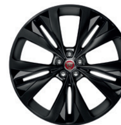
22" Double Helix, 15 spoke, with Black finish and Dark inserts