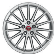
18" Lightweight, 15 spoke, with Silver finish