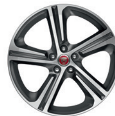
20" Blade, 5 spoke, with Grey Diamond Turned finish