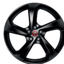
19" Fan, 5 spoke, with Gloss Black finish