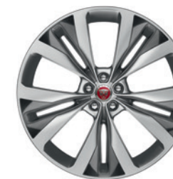
22" Double Helix, 15 spoke, with Silver finish and Dark inserts