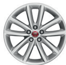
18" Vortex, 10 spoke, with Silver finish