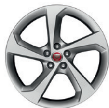
19" Fan, 5 spoke, with Silver finish