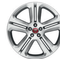
20" Templar, 5 twin-spoke, with Silver finish