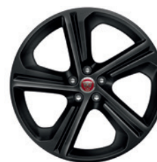
20" Blade, 5 spoke, with Black finish