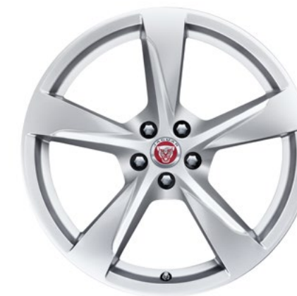
20" Style 5060, 5 spoke