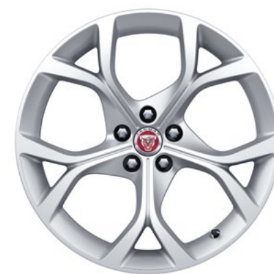
19" Style 5101, 5 split-spoke, Silver