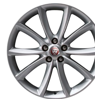
19" Style 1023, 10 spoke