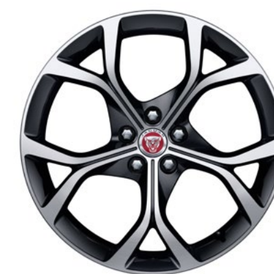
19" Style 5101, 5 split-spoke, Gloss Black Diamond Turned finish