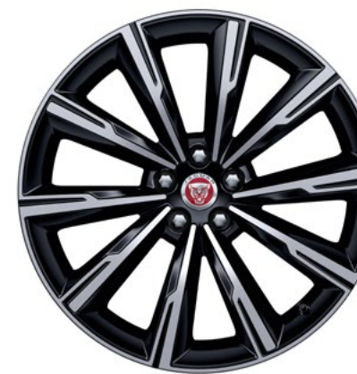
20" Style 1066, 10 spoke, Gloss Black Diamond Turned finish