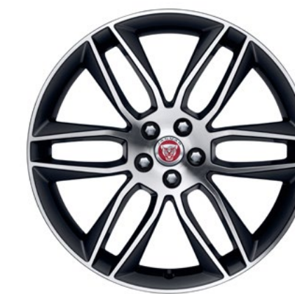
20" Style 6003, 6 split-spoke, Dark Grey Diamond Turned finish