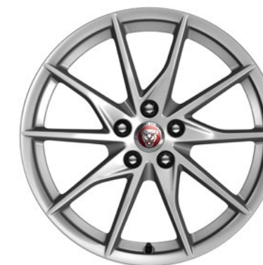
18" Style 1036, 10 spoke