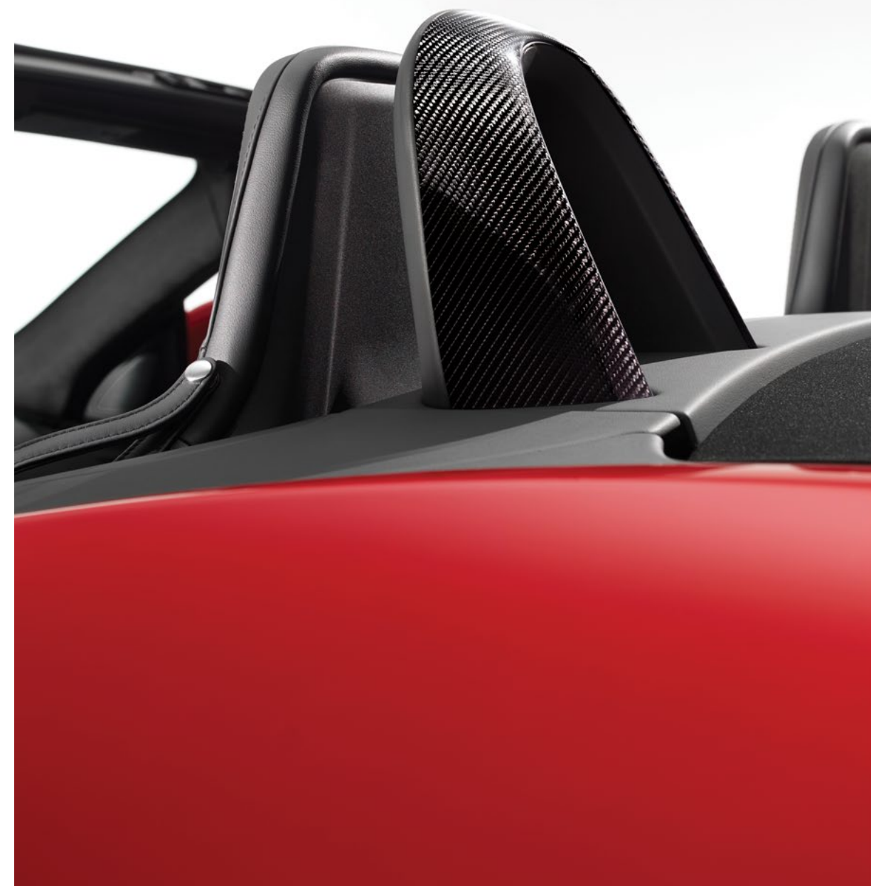
Silver Weave Carbon Fibre Roll Hoops