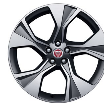
20" Style 5102, 5 spoke, Technical Grey Diamond Turned finish