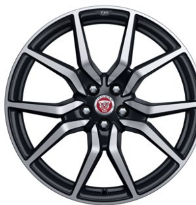
20" Style 1041, 10 spoke, Forged, Satin Black Diamond Turned finish