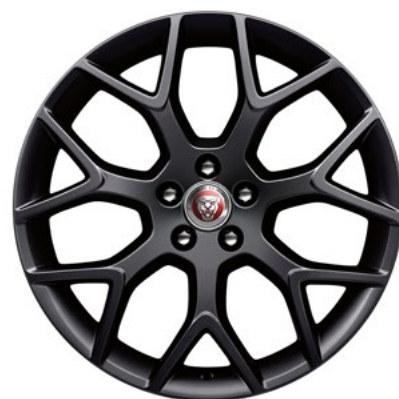
19" Style 7013, 7 split-spoke, Black