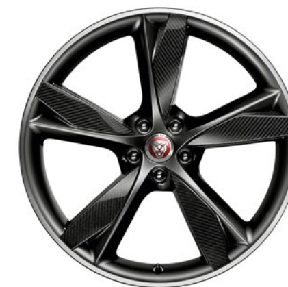
20" Style 5042, 5 spoke, Forged, Carbon Fibre and Satin Dark Grey Diamond Turned finish