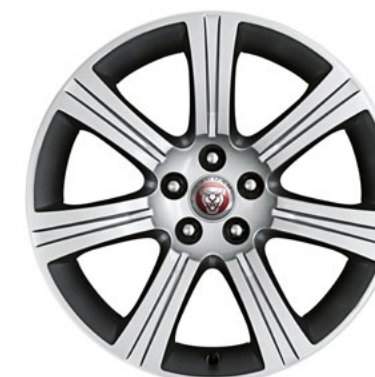
18" Style 7017, 7 spoke