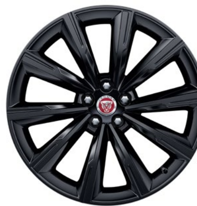
20" Style 1066, 10 spoke, Gloss Black