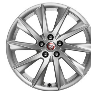
18" Style 1024, 10 spoke