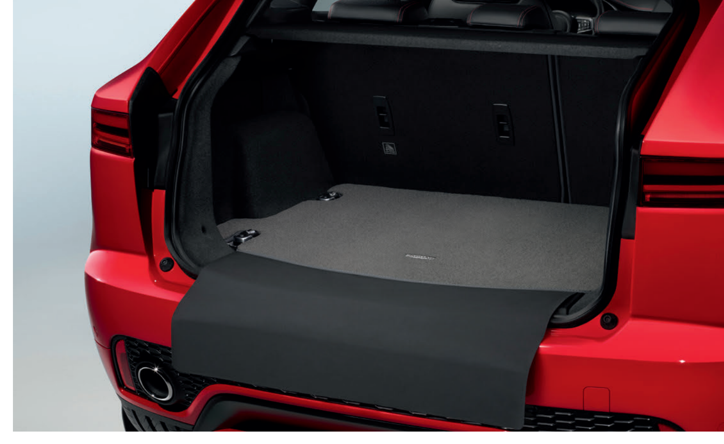
Luggage Compartment Luxury Carpet Mat - with Bumper Protector Luxurious, soft luggage mat with the Jaguar logo. Deep premium 2,050g/m<sup>2</sup> pile with nubuck edging.

Luxurious, tailored 2,050g/m<sup>2</sup> pile front and rear carpet mats with embossed Jaguar logo and nubuck edge binding.