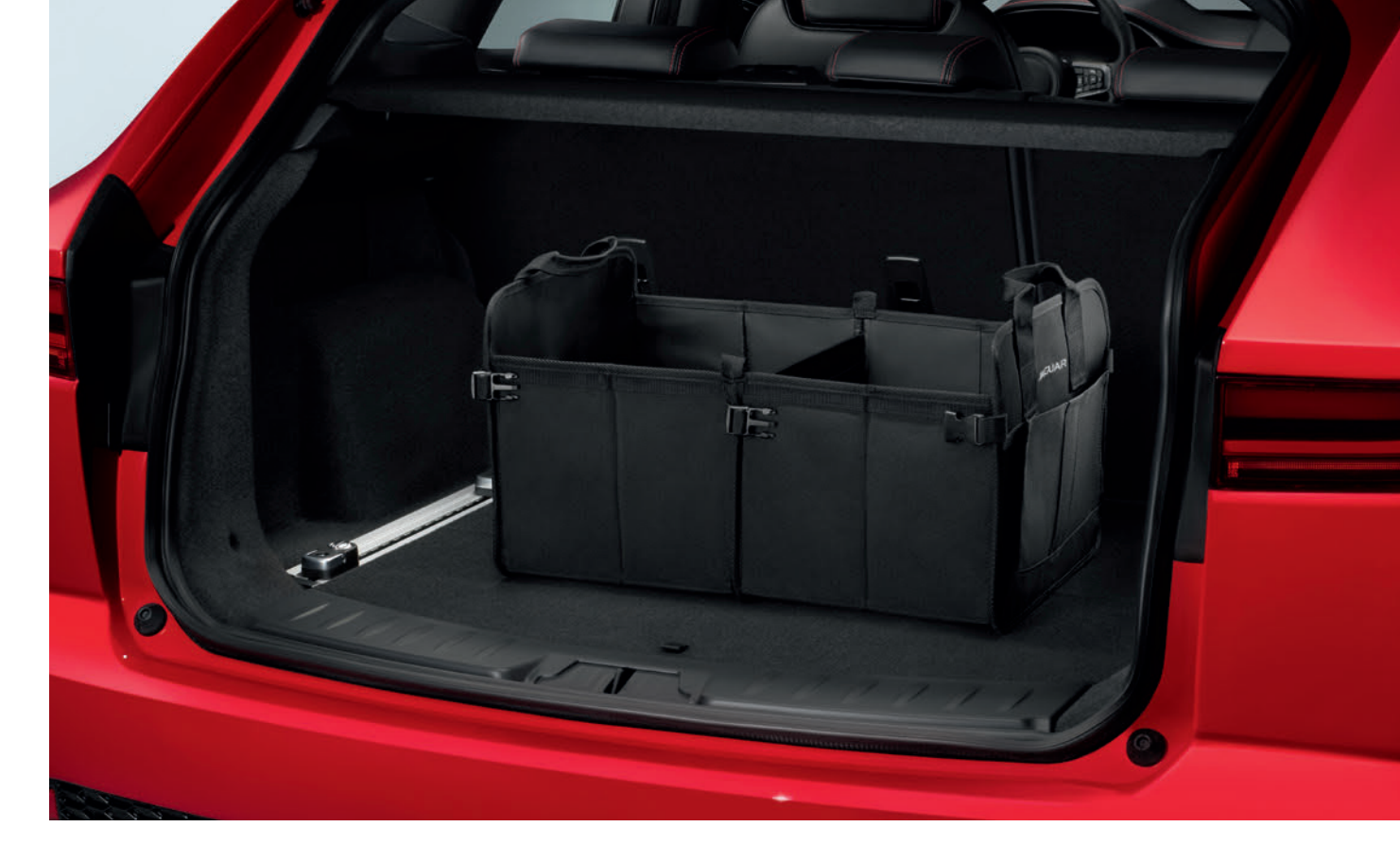
Luggage Compartment Collapsible Organiser Keeps items from shifting during transport with two durable straps.

Luggage Compartment Rubber Liner Tray This premium liner tray tailored specifically for your vehicle will protect the luggage compartment floor with a raised lip around the edges to protect the side walls.