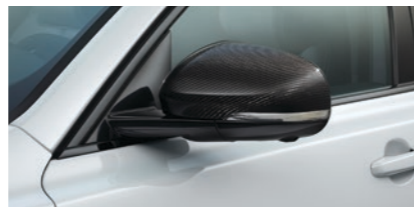
Mirror Covers – Carbon Fibre High grade Carbon Fibre mirror covers provide a performance-inspired styling upgrade.