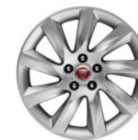
17" 9 Spoke, 'Style 9005', Alloy Wheel