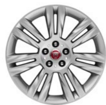
18" 7 Split-Spoke, 'Style 7011', Alloy Wheel