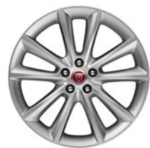
19" 10 Spoke, 'Style 1018', Alloy Wheel