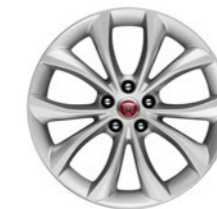
18" 10 Spoke, 'Style 5033', Alloy Wheel