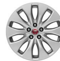
17" 10 Spoke, 'Style 1017', Alloy Wheel

Personalise your vehicle with a selection of alloy wheels featuring a wide range of contemporary and dynamic designs.