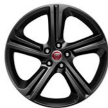
19" 5 Spoke, 'Style 5035', with Gloss Black finish, Alloy Wheel