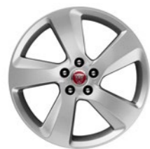
18" 5 Spoke, 'Style 5034', Alloy Wheel