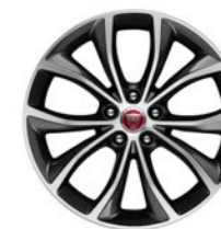
18" 10 Spoke, 'Style 5033', with Contrast Diamond Turned finish, Alloy Wheel