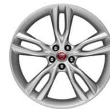
20" 5 Split-Spoke, 'Style 5071', Alloy Wheel