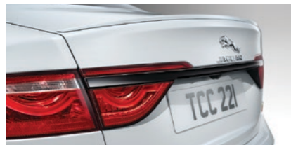
Rear Tailgate Trim – Gloss Black Add style and visual distinction with Gloss Black finish rear tailgate trim.