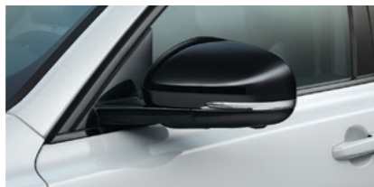
Mirror Covers – Gloss Black Gloss Black mirror covers accentuate the dynamic design of the exterior mirrors.