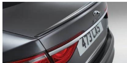
Rear Spoiler – Body Coloured Give the XF an even more sporting look with this body coloured spoiler exterior styling upgrade.