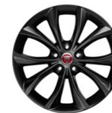
18" 10 Spoke 'Style 5033' with Gloss Black finish, Alloy Wheel