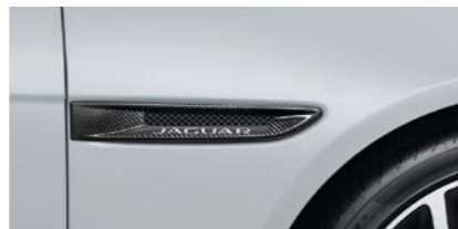
Side Power Vents – Carbon Fibre High grade Carbon Fibre side power vents provide a performance-inspired styling upgrade.