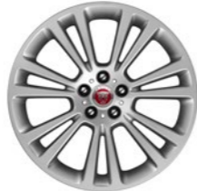
19" 7 Split-Spoke, 'Style 7013', Alloy Wheel