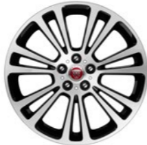
19" 7 Split-Spoke, 'Style 7013', with Contrast Diamond Turned finish, Alloy Wheel