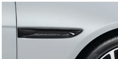
Side Power Vents – Gloss Black Jaguar branded Gloss Black side power vents provide a dynamic exterior styling enhancement.