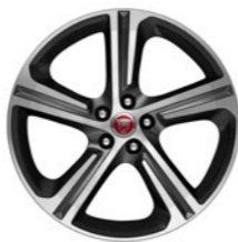
19" 5 Spoke, 'Style 5035', with Satin Grey Diamond Turned finish, Alloy Wheel