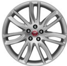
19" 7 Split-Spoke, 'Style 7012', Alloy Wheel