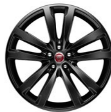
20" 5 Split-Spoke, 'Style 5031', with Gloss Black finish, Alloy Wheel