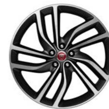
20" 5 Split-Spoke, 'Style 5036', with Satin Dark Grey Diamond Turned finish, Alloy Wheel