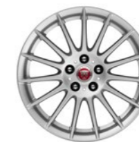
17" 10 Spoke, 'Style 1016', Alloy Wheel