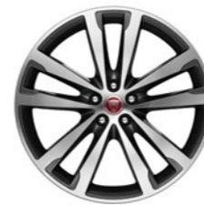
20" 5 Split-Spoke, 'Style 5031', with Gloss Dark Grey Diamond Turned finish, Alloy Wheel