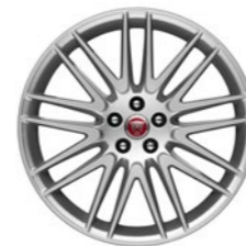
20" 9 Split-Spoke, 'Style 9004', Alloy Wheel