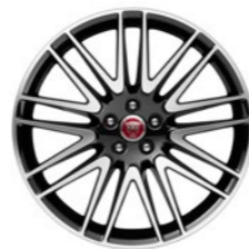
20" 9 Split-Spoke, 'Style 9004', with Contrast Diamond Turned finish, Alloy Wheel