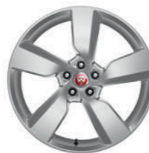
19" 5 Spoke, 'Style 5049' with Silver Sparkle Finish