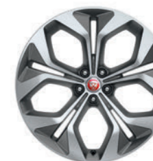
21" 5 Split-Spoke, 'Style 5053' with Satin Grey Diamond Turned Finish