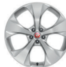
20" 5 Spoke, 'Style 5054'