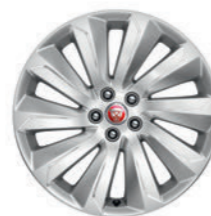
19" 10 Spoke, 'Style 1039'