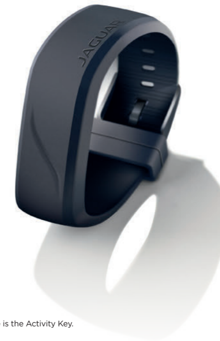
Product shown in the image above is the Activity Key.

For extra convenience, owners can lock their key fob inside their vehicle and wear the activity key wristband, alleviating the need to carry their conventional key fob. The wristband is lightweight, robust and fully waterproof allowing customers to participate in a range of activities, then regain access back into their own vehicle. Conventional key fob is deactivated for total security.