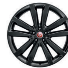
20" 5 Split-Spoke, 'Style 5051' with Gloss Black Finish