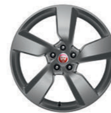
19" 5 Spoke, 'Style 5049' with Satin Dark Grey Finish