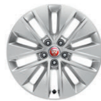
17" 10 Spoke, 'Style 1037'