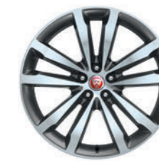
20" 5 Split-Spoke, 'Style 5051' with Satin Grey Diamond Turned Finish