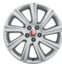
18" 9 Spoke, 'Style 9008'