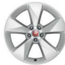
18" 5 Spoke, 'Style 5048'