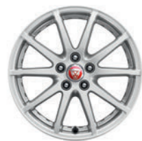
17" 10 Spoke, 'Style 1005'

Personalise your vehicle with a selection of alloy wheels featuring a wide range of contemporary and dynamic designs.