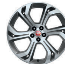
20" 6 Split-Spoke, 'Style 6014' with Satin Grey Diamond Turned Finish