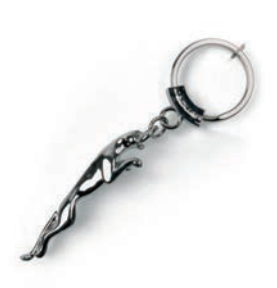
LEAPER KEYRING Keyring with 3D Leaper branded ring slider. SILVER - 50JDKR927SL