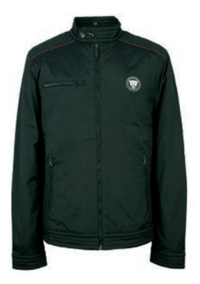
MEN'S DRIVERS JACKET

Worthy of any road, wardrobe or occasion. This lightly padded jacket in Black features quilted upper back panel and contrast burgundy piping, with two side pockets, button-up collar and Jaguar branded hardware. Silicone Growler Logo to the chest.