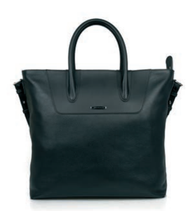
ULTIMATE LEATHER TOTE BAG

A STYLISH RANGE OF WOMEN'S WEAR THAT'S MADE TO TRAVEL.