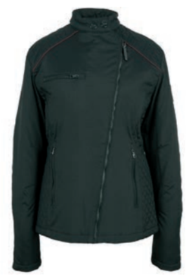
WOMEN'S DRIVERS JACKET

Worthy of any road, wardrobe or occasion. This lightly padded jacket in Black has a feminine cut with quilted detailing, maroon piping, cross-body zip, button-up collar and Jaguar branded hardware. Silicone Growler to the chest.