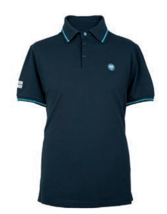
MEN'S GROWLER GRAPHIC POLO SHIRT

THE ESSENTIAL MEN'S COLLECTION FOR LIFE ON THE GO.