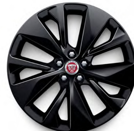
19" Style 5106, 5 split-spoke, Gloss Black