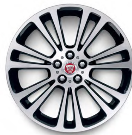
19" Style 7013, 7 split-spoke, Contrast Diamond Turned finish