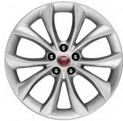
18" Style 5033, 5 split-spoke, Silver