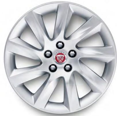
17" Style 9005, 9 spoke, Silver

Personalise your vehicle with a selection of alloy wheels featuring a wide range of contemporary and dynamic designs.