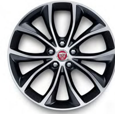
18" Style 5033, 5 split-spoke, Contrast Diamond Turned finish