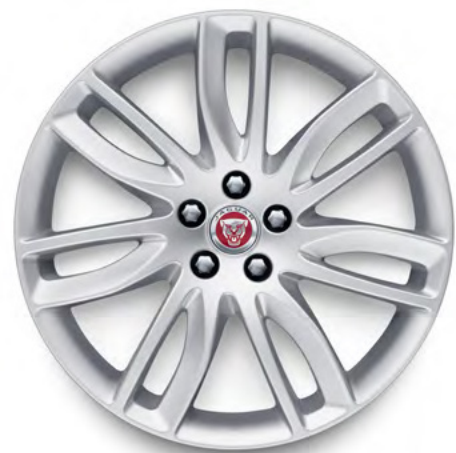
19" Style 7012, 7 split-spoke, Silver

Personalise your vehicle with a selection of alloy wheels featuring a wide range of contemporary and dynamic designs.