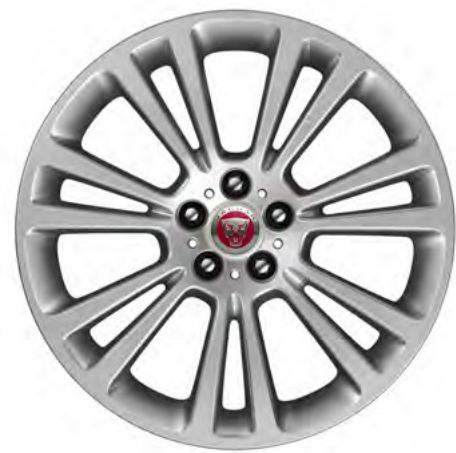
19" Style 7013, 7 split-spoke, Silver