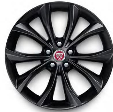
18" Style 5033, 5 split-spoke, Gloss Black