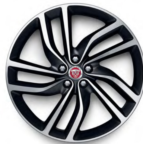
20" Style 5036, 5 split-spoke, Satin Dark Grey Diamond Turned finish