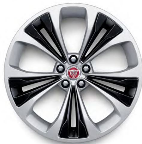
20" Style 5107, 5 split-spoke, Silver with Gloss Black Inserts