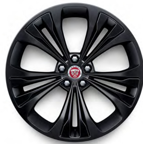
20" Style 5107, 5 split-spoke, Satin Black with Gloss Black inserts