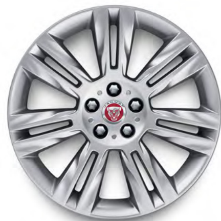
18" Style 7011, 7 split-spoke, Silver