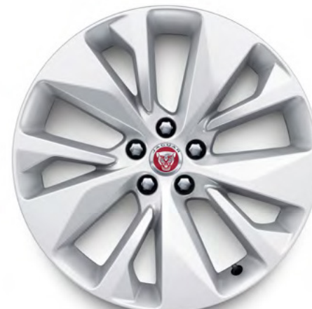
19" Style 5106, 5 split-spoke, Silver