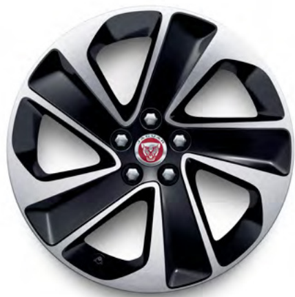
18" Style 5105, 5 spoke, Dark Grey Diamond Turned finish