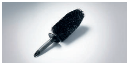
Wheel Cleaner Brush This shaped wheel cleaner brush is specifically designed to the contours of your vehicle's wheels.