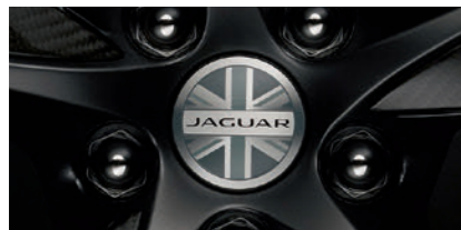
Wheel Centre Badge A distinctive monochrome centre badge featuring the Jaguar logo with a Union Jack design providing a British twist.