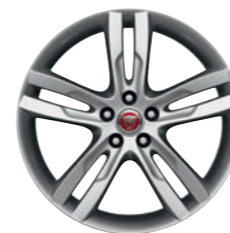
19" Star, 5 twin-spoke, with Silver finish