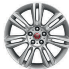
18" Matrix, 7 twin-spoke, with Silver finish