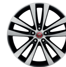
19" Venom 5 twin-spoke, Anthracite with Silver finish