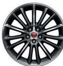
19" Radiance 15 spoke, with Black finish