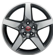
18" Star, 5 spoke, with Silver finish