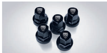
'Growler' Wheel Nuts Enhance the look of your vehicle's wheels with Jaguar branded Black wheel nuts.