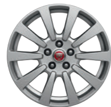
17" Turbine, 10 spoke