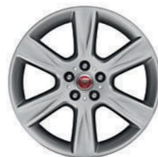
18" Arm, 6 spoke, with Silver finish