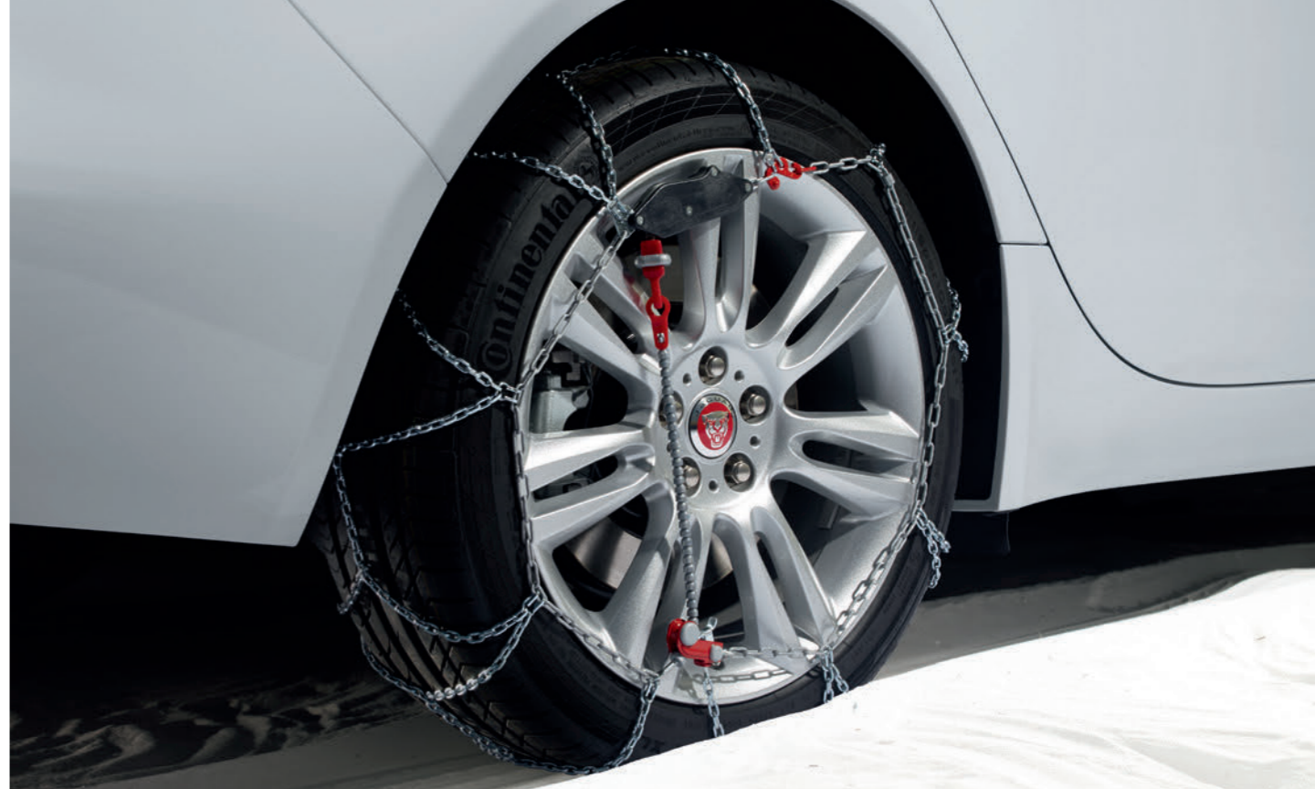
Snow Traction System Improved mobility in snow, mud and icy driving conditions with this high-grip snow chain traction system. Fits the rear wheels only.