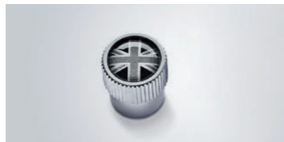
Styled Valve Caps Add the finishing touch to your vehicle's wheels with a range of unique custom valve caps.