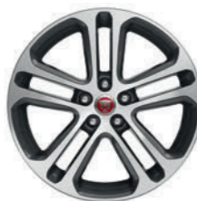
18" Templar 5 twin-spoke, with Mid Silver finish