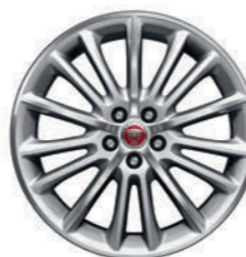
19" Radiance 15 spoke, with Silver finish