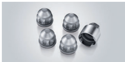
Locking Wheel Nuts - Chrome Protect wheels with custom designed high-security Chrome locking wheel nuts.