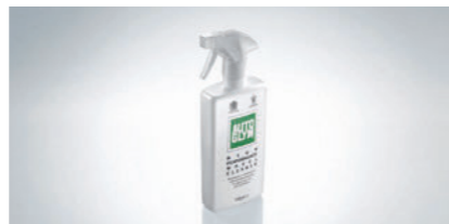
Wheel Cleaner - 500ml Trigger Spray Jaguar and Autoglym have collaborated to develop and rigorously test a unique high performance wheel cleaner.