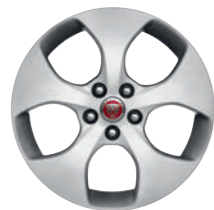
17" Projector, 5 spoke, with Silver finish

Personalise your vehicle with a selection of alloy wheels featuring a wide range of contemporary and dynamic designs.