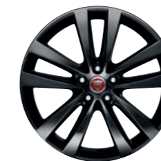
19" Venom 5 twin-spoke, with Gloss Black finish