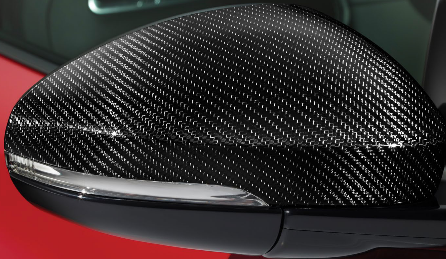
Silver Weave Carbon Fibre Mirror Covers

High grade Silver Weave Carbon Fibre mirror covers and roll hoops provide a performance-inspired styling enhancement. Featuring a 2x2 twill weave with an eye-catching aluminium thread and a High Gloss lacquered finish.