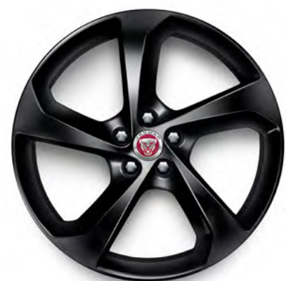
19" Style 5037, 5 spoke, Gloss Black