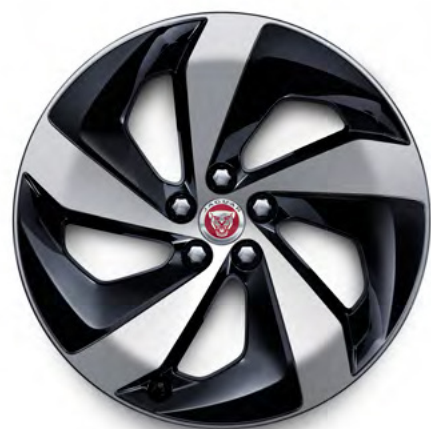
21" Style 7024, 7 spoke, Gloss Black Diamond Turned finish