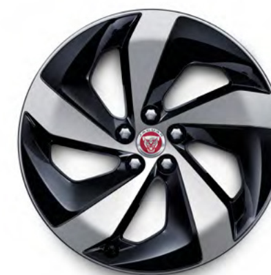
19" Style 5103, 5 spoke, Gloss Black with contrast Diamond Turned finish