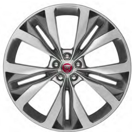
22" Style 1020, 15 spoke, Gloss Silver with contrast inserts