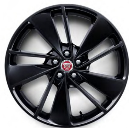
20" Style 1067, 10 spoke, Gloss Black