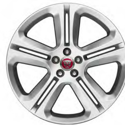
20" Style 5036, 5 split-spoke, Gloss Sparkle Silver