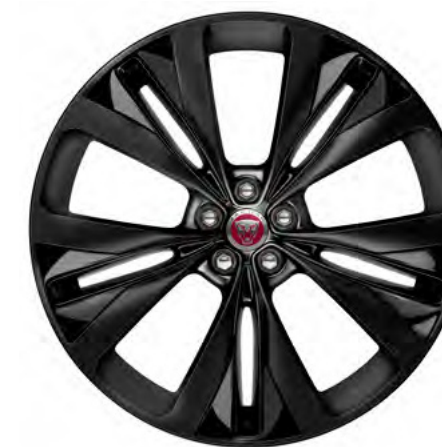
22" Style 1020, 15 spoke, Gloss Black with Satin Black inserts