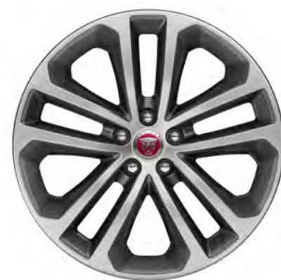
19" Style 5038, 5 split-spoke, Gloss Grey with contrast Diamond Turned finish