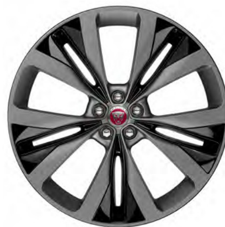
22" Style 1020, 15 spoke, Gloss Grey with contrast inserts