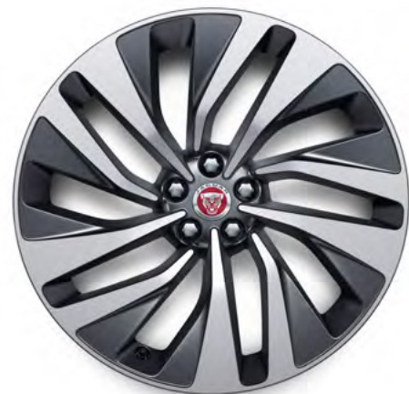
21" Style 1068, 10 spoke, Satin Dark Grey with contrast Diamond Turned finish

Personalise your vehicle with a selection of alloy wheels featuring a wide range of contemporary and dynamic designs.