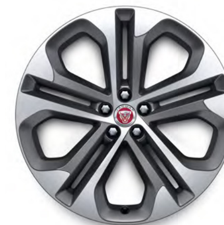
21" Style 5104, 5 split-spoke, Satin Dark Grey with contrast Diamond Turned finish