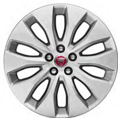
18" Style 1021, 10 spoke, Gloss Sparkle Silver

Personalise your vehicle with a selection of alloy wheels featuring a wide range of contemporary and dynamic designs.