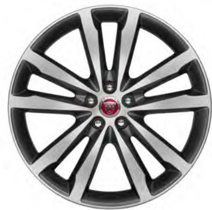
20" Style 5031, 5 split-spoke, Gloss Grey with contrast Diamond Turned finish